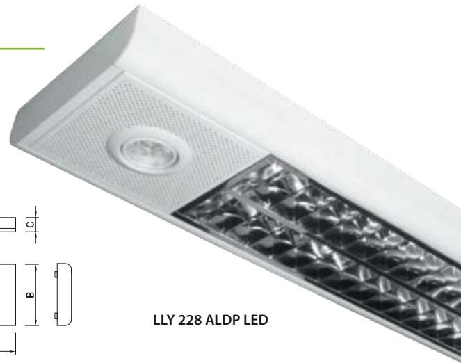
LLY 228 ALDP LED