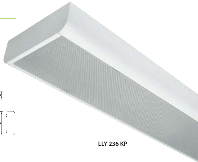
LLY 236 KP