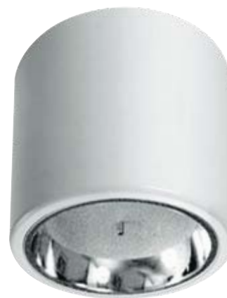
SSC AL K1